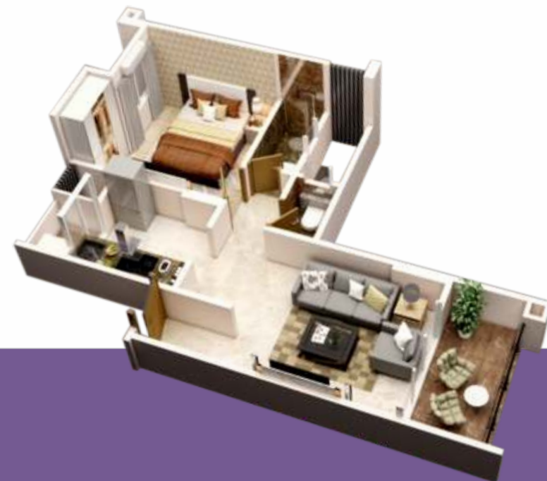
1 BHK Flat