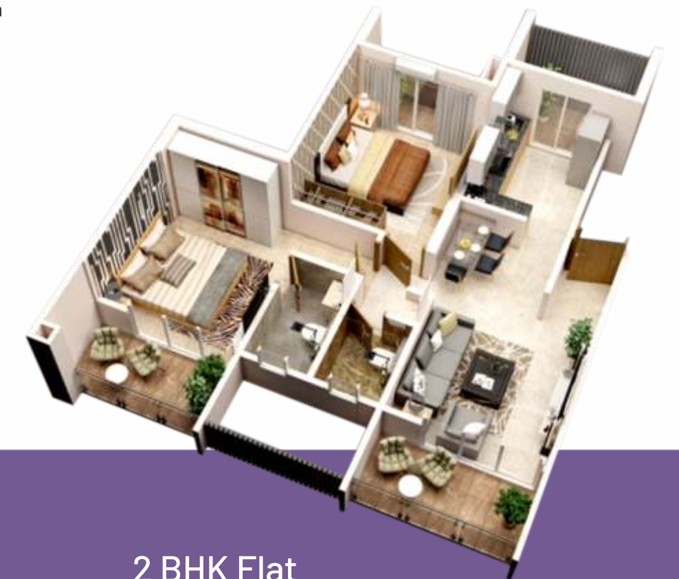
2 BHK Flat