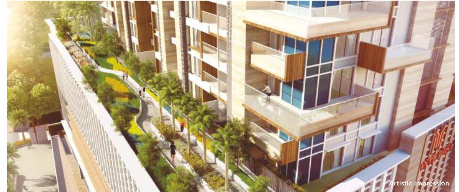
170-Metre Jogging Track