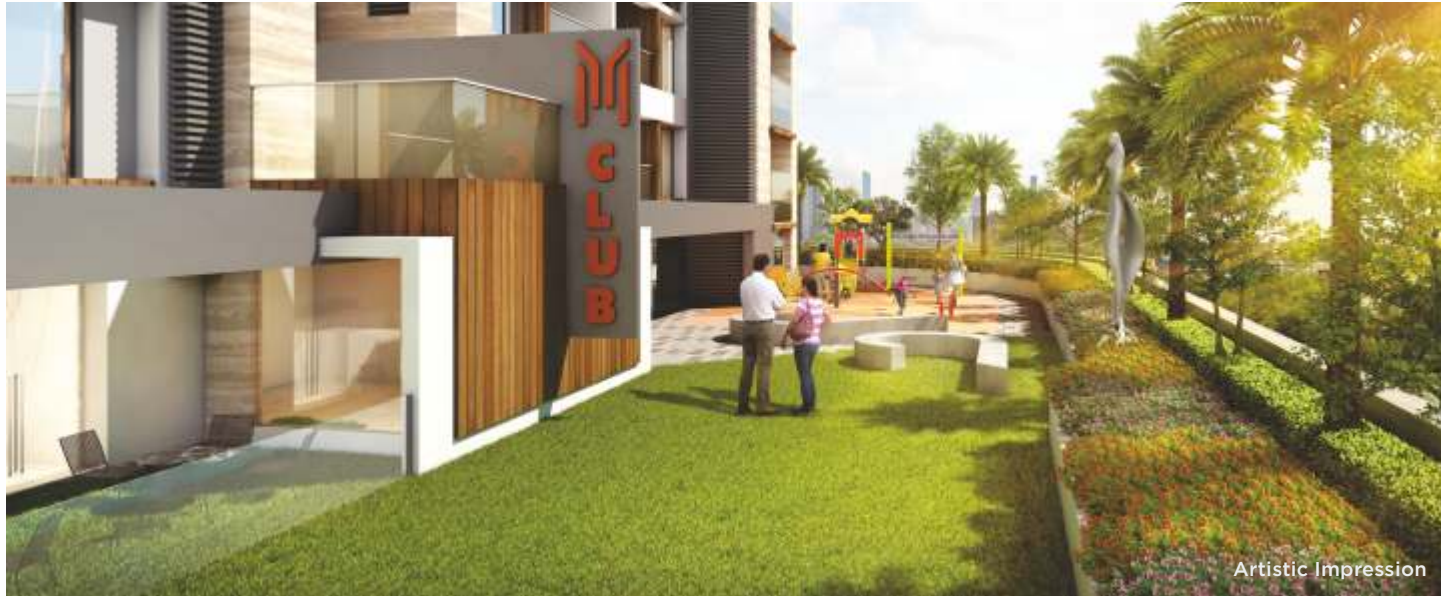
Children's Outdoor Play Zone