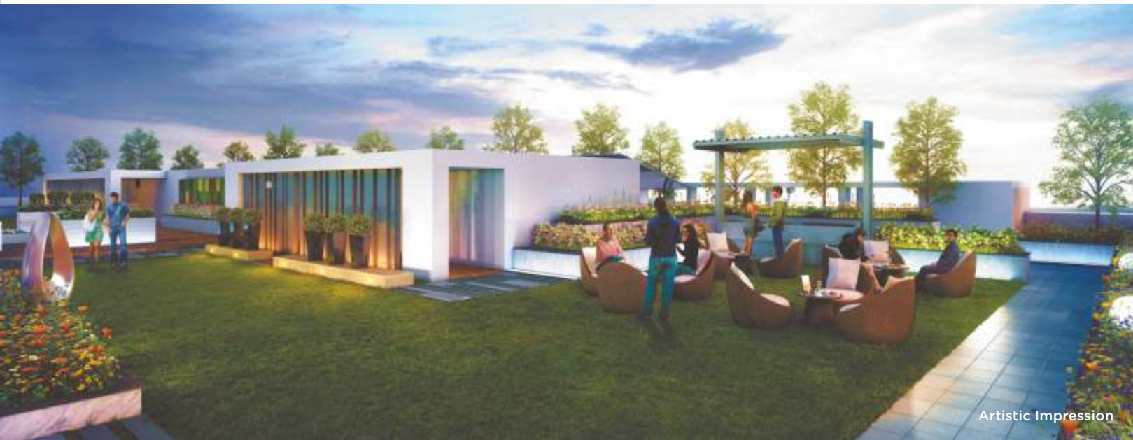
Glass Skywalk | Barbeque Zone | Landscape Rooftop Party Area